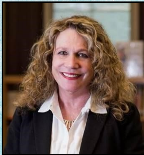
Superintendent of Schools