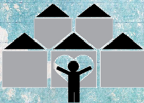
Promote the Well-Being of the Whole Child, Whole School, Whole Community