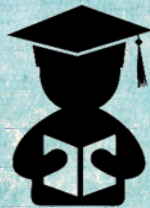
Ensure Powerful Learning for Every Student