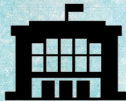
Build Capacity to Ensure Comprehensive School Improvement