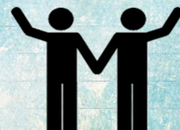
Cultivate Understanding, Collaboration, Partnerships and Advocacy for Equity and Justice for All